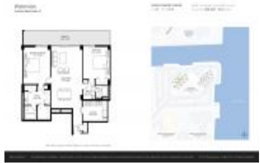
Built in 1981 - 394 units - 23 floors

The above valuated price is a baseline figure that does not take into account any specific renovation, upgrade, split, merge, or deterioration of the unit.