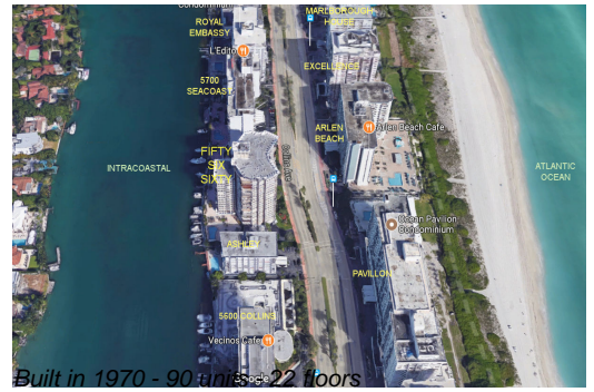
Built in 1970 - 90 units, 22 floors

The above valuated price is a baseline figure that does not take into account any specific renovation, upgrade, split, merge, or deterioration of the unit.