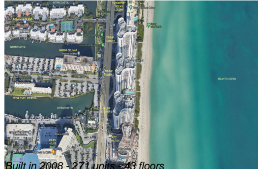
Built in 2008 - 271 units - 43 floors