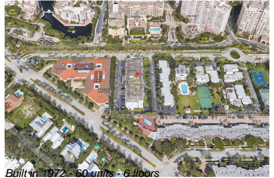
Built in 1972 - 60 units - 6 floors