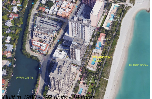
Built in 1980 - 192 units - 19 floors