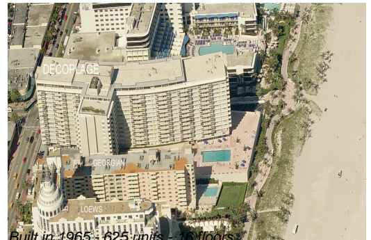
Built in 1965 - 625 units - 14 floors