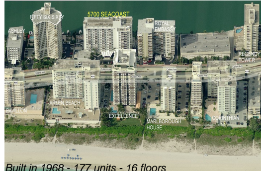
Built in 1968 - 177 units - 16 floors