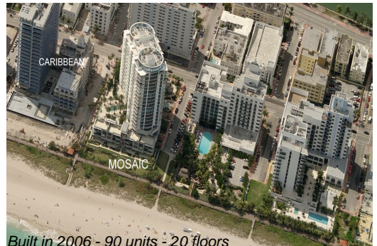
Built in 2006 - 90 units - 20 floors