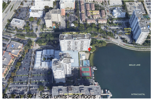
Built in 1971 - 321 units - 22 floors