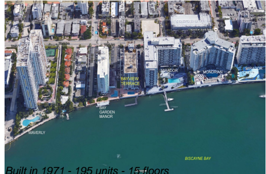
Built in 1971 - 195 units - 15 floors