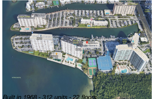
Built in 1968 - 312 units - 22 floors