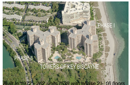
Built in 1972 - 262 units (538 with phase 2)- 16 floors