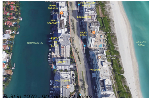
Built in 1970 - 90 units, 22 floors