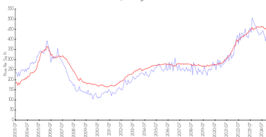
Grand View Palace vs North Bay Village