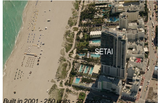
Built in 2001 - 250 units - 39 active listings