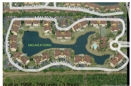
built in 1998 - 258 units - 3 floors