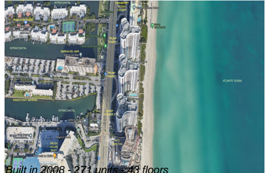
Built in 2008 - 271 units - 43 floors