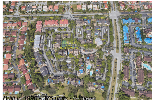
Built in 1990 - 375 units - 3 floors