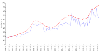
5151 Seacoast vs Miami Beach