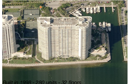
Built in: 1998 - 280 units - 32 floors