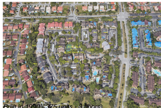
Built in 1990 - 375 units - 3 floors