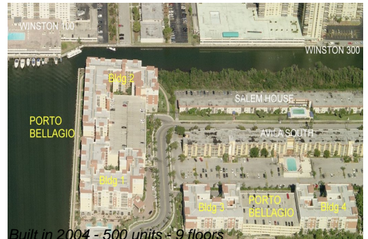
Built in 2004 - 500 units - 9 floors