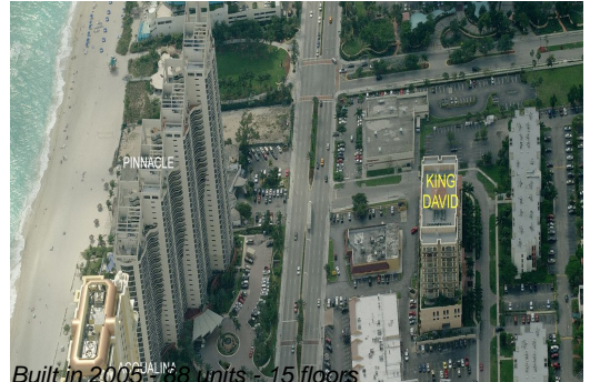
Built in 2005 - 88 units - 15 floors