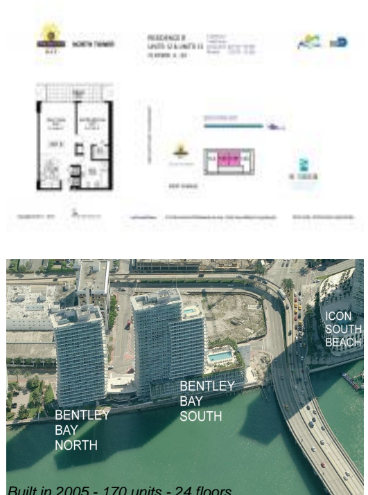
Built in 2005 - 170 units - 24 floors