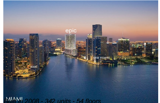
MIAMI 2008 - 342 units - 54 floors