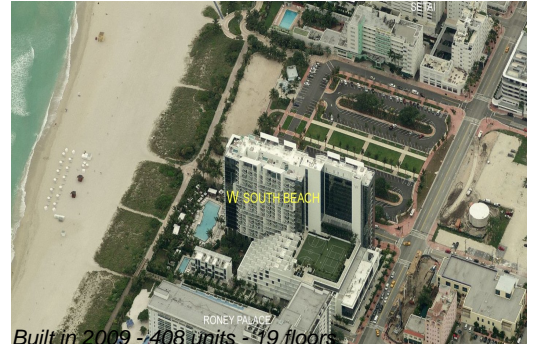
Built in 2009 - 408 units - 19 floors