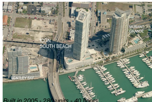
Built in 2005 - 280 units - 40 floors