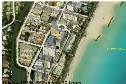
Built in 1966 - 562 units - 19 floors