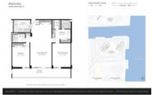
Built in 1981 - 394 units - 23 floors

The above valuated price is a baseline figure that does not take into account any specific renovation, upgrade, split, merge, or deterioration of the unit.