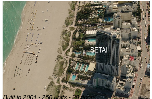
Built in 2001 - 250 units - 39