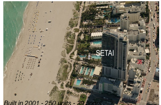
Built in 2001 - 250 units - 39