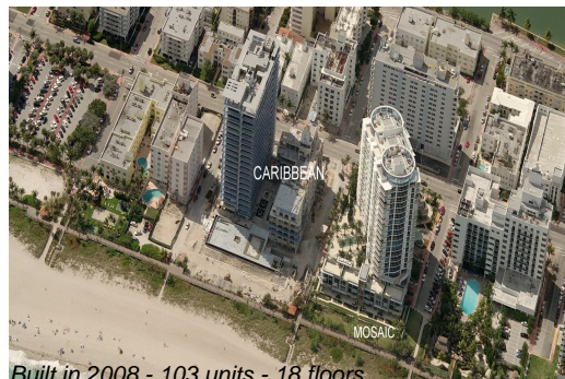
Built in 2008 - 103 units - 18 floors