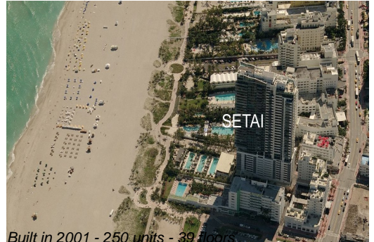
Built in 2001 - 250 units - 39 units for sale