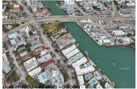
Built in 1980 - 48 units - 5 floors