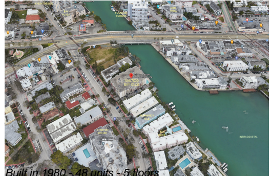
Built in 1980 - 48 units - 5 floors