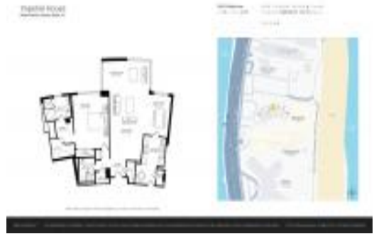
Built in 1963 - 127 units - 16 floors

The above valuated price is a baseline figure that does not take into account any specific renovation, upgrade, split, merge, or deterioration of the unit.