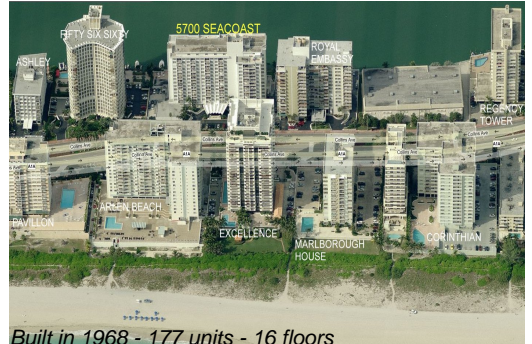
Built in 1968 - 177 units - 16 floors