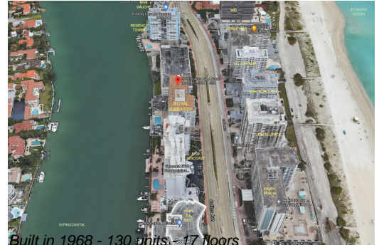
Built in 1968 - 130 units - 17 floors