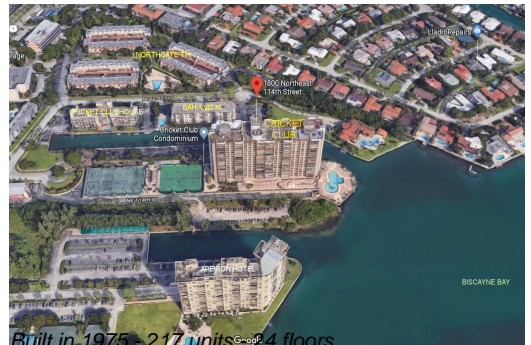
Built in 1975 - 217 units - 4 floors