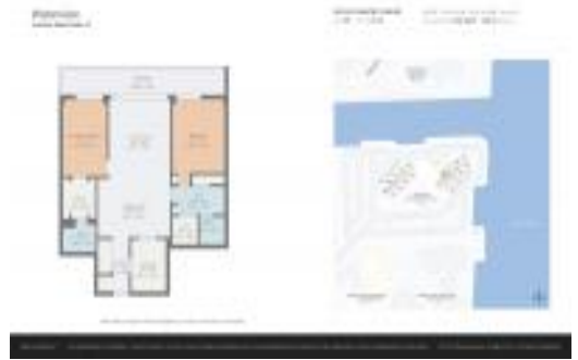
Built in 1981 - 394 units - 23 floors

The above valuated price is a baseline figure that does not take into account any specific renovation, upgrade, split, merge, or deterioration of the unit.