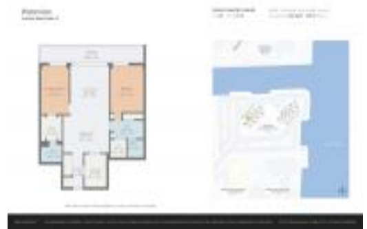
Built in 1981 - 394 units - 23 floors

The above valuated price is a baseline figure that does not take into account any specific renovation, upgrade, split, merge, or deterioration of the unit.