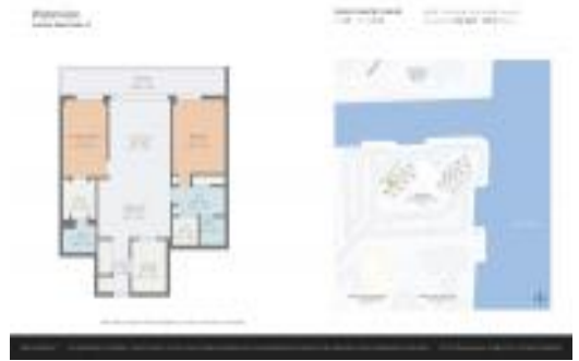
Built in 1981 - 394 units - 23 floors

The above valuated price is a baseline figure that does not take into account any specific renovation, upgrade, split, merge, or deterioration of the unit.