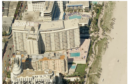
Built in 1965 - 625 units - 14 floors