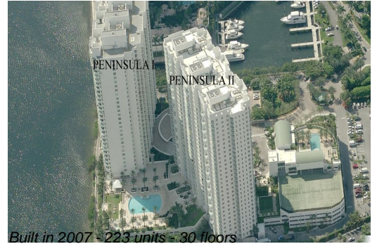
Built in 2007 - 223 units - 30 floors