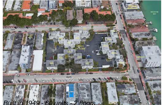
Built in 1949 - 60 units - 2 floors