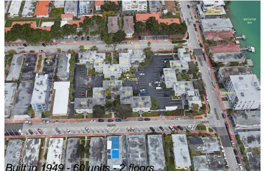
Built in 1949 - 60 units - 2 floors