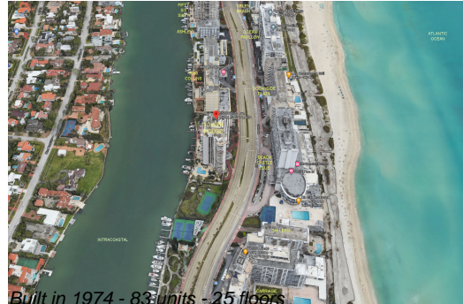
Built in 1974 - 83 units - 25 floors