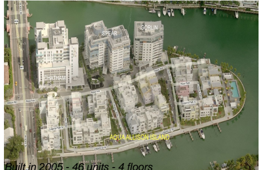
Built in 2005 - 46 units - 4 floors