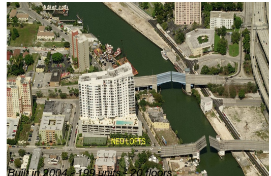
Built in 2004 - 199 units - 20 floors