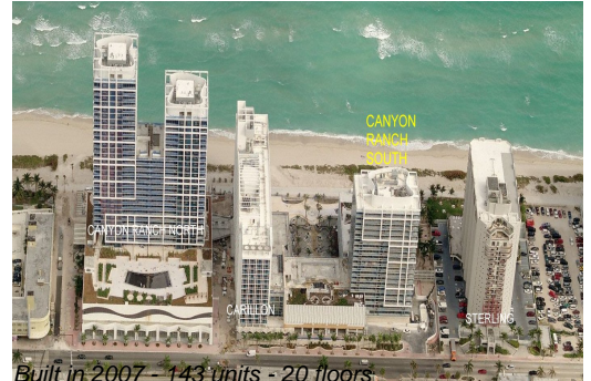
Built in 2007 - 143 units - 20 floors