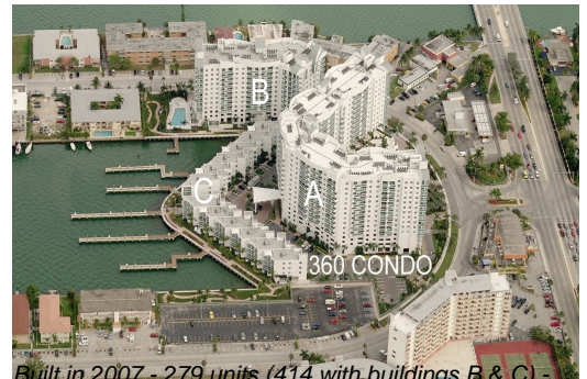
Built in 2007 - 279 units (414 with buildings B & C) - 15 floors