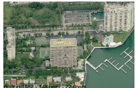
Built in 1982 - 148 units - 22 floors