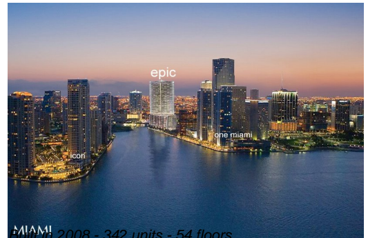
MIAMI 2008 - 342 units - 54 floors